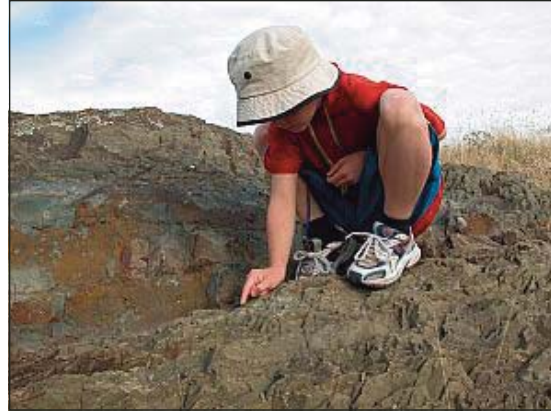
Finding fossils in Silurian rocks in Canberra, Australia.