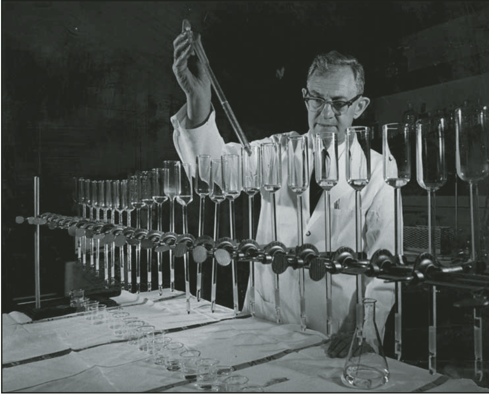
The Pineal Gland and the “Melatonin Hypothesis,” 1959–1974

the hypothesis fail. Science is often more about proving a scientific statement wrong rather than right. If it does fail, another hypothesis may be tested, usually one that has taken into consideration the fact that the last tested hypothesis failed.