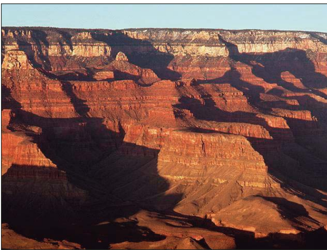
Layers rocks making up the walls of the Grand Canyon.

Scientists formulate and test their explanations of nature using observation, experiments, and theoretical and mathematical models. Although all scientific ideas are tentative and subject to change and improvement in principle, for most major ideas in science, there is much experimental and observational confirmation. Those ideas are not likely to change greatly in the future. Scientists do and have changed their ideas about nature when they encounter new experimental evidence that does not match their existing explanations. (NSES, 1996, p. 171)