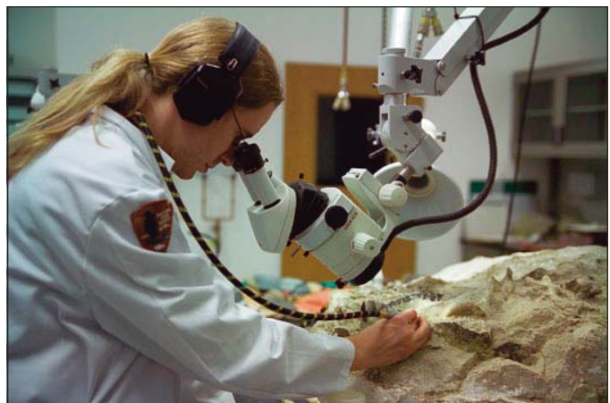
Fossil Lab at John Day Fossil Beds National Monument.

Unfortunately, the common/non-scientific definition for theory is quite different, and is more typically thought of as a belief that can guide behavior. Some examples: " His speech was based on the theory that people hear only what they want to know " or " It's just a theory. " Because of the nature of this definition, some people wrongly assume scientific theories are speculative, unsupported, or easily cast aside, which is very far from the truth. A scientific hypothesis that survives extensive experimental testing without being shown to be false becomes a scientific theory. Accepted scientific theories also produce testable predictions that are successful.